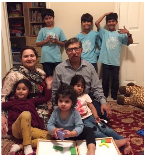
Having fun with grandchildren