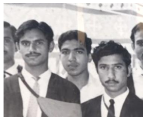
Our KE Graduation Day-1971

This talent-based scholarship, starting in 2023, will recognize the top two graduating high school students at Government Islamia Higher Secondary School, 202 RB Gatti, Faisal Abad . The distribution will be 60 % and 40 % between these two students.