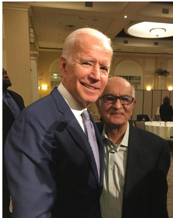
With Joe Biden

In the other picture, he is with his neighbors at that award ceremony.