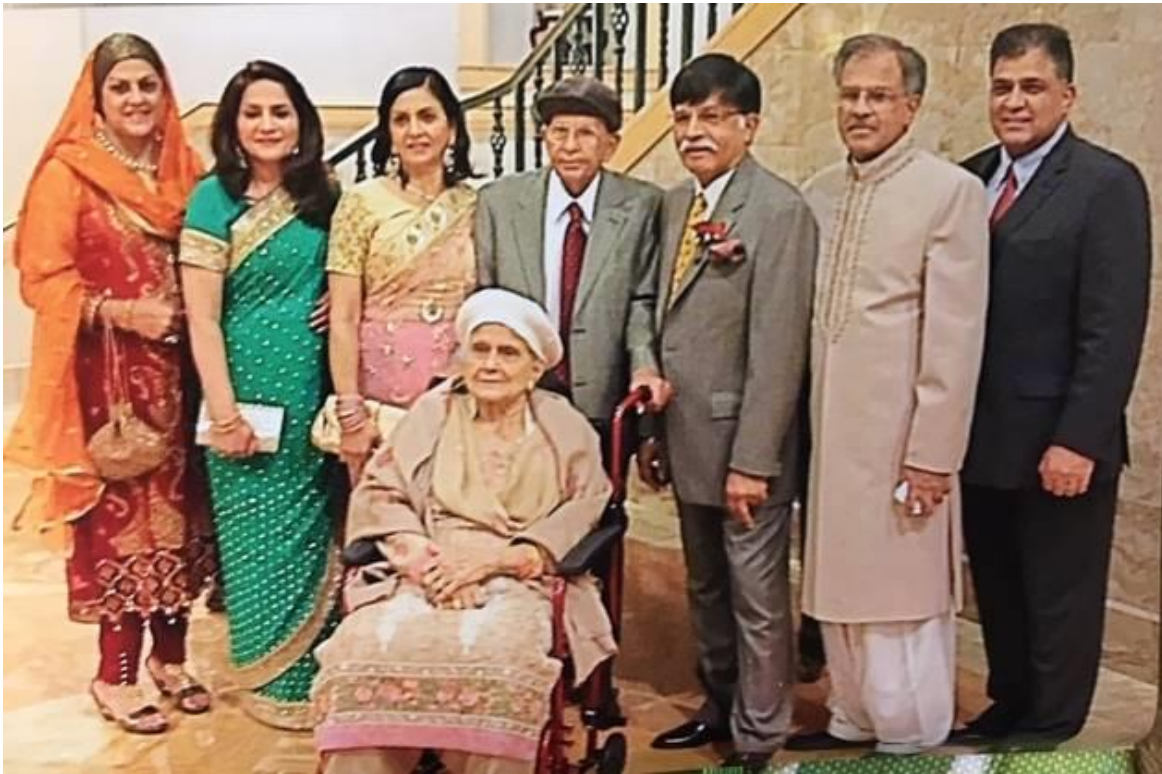
Children and Grandchildren