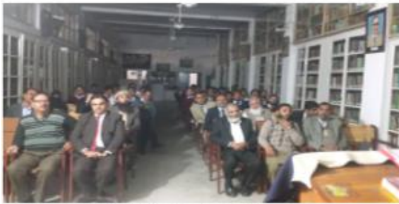
Guests, academic staff and students at the seminar