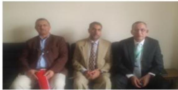
Chief Guest and staff members at the Principal's office.